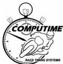
Clerk of Course - Peter Woods

COMPUTIME RACE TIMING SYSTEMS PTY LTD www.computime.com.au